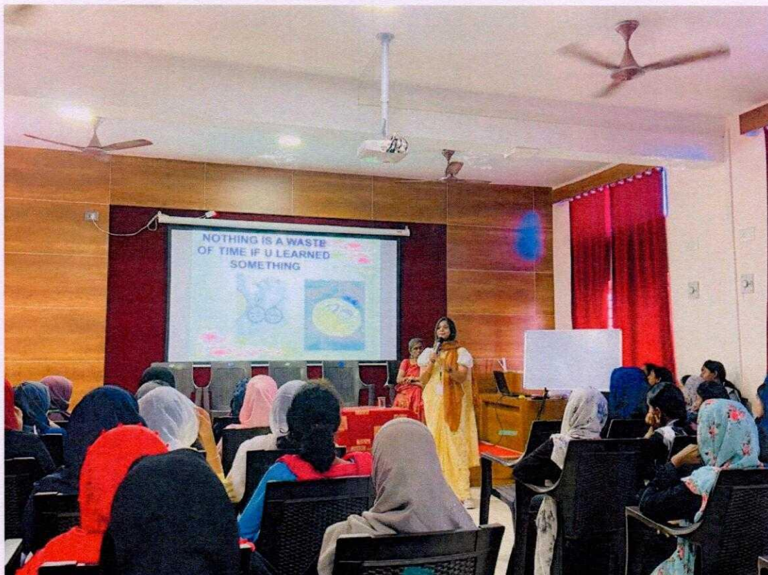
RESOURCE PERSON EXPLAINING THE CONCEPTS