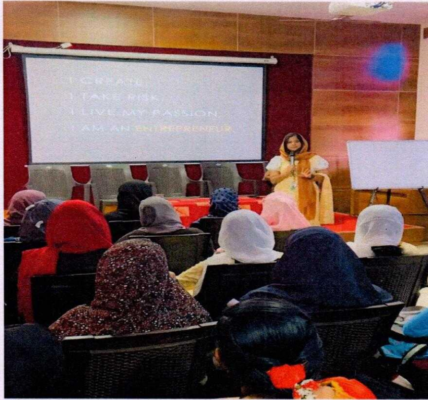
CHIEF GUEST GIVING THE IDEAS FOR BECOME ENTREPRENEUR